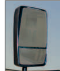
Breakaway Convex Mirrors